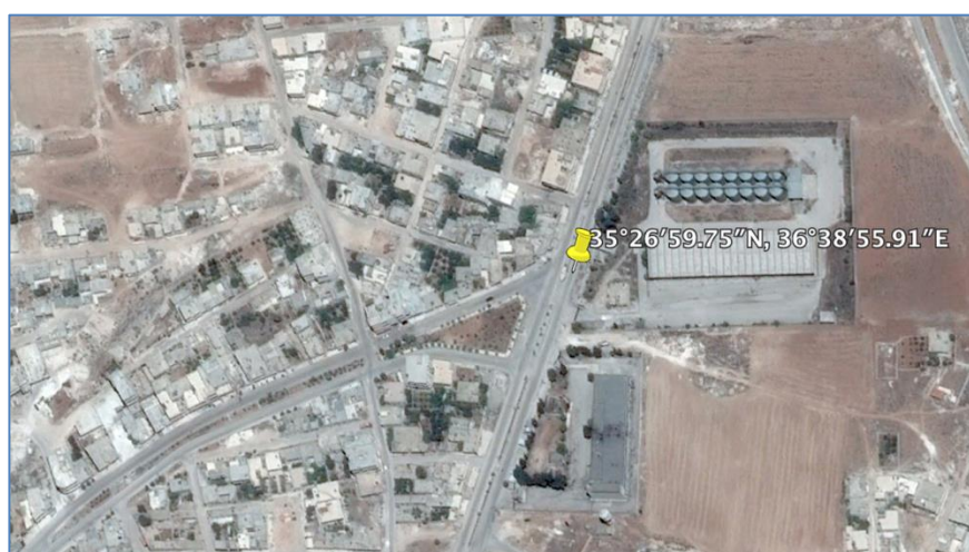
Figure 1: Chemical impact site at 35°26'59.75"N, 36°38'55.91"E with the grain silos to the northeast of the site